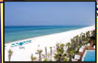
Casa Loma's Beautiful View